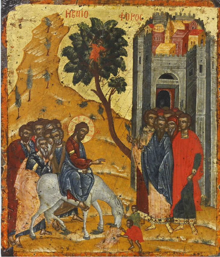
Our Lord's Triumphant Entry Into Jerusalem

Yesterday, our Lord raised Lazarus from the dead after four days in the tomb. Today He enters into Jerusalem; greeted by the crowds who proclaim: "Blessed is He who comes in the name of the Lord; Hosanna in the highest!". The same crowd who greets him with such great joy on Palm Sunday, condemns Him to death on Good Friday.