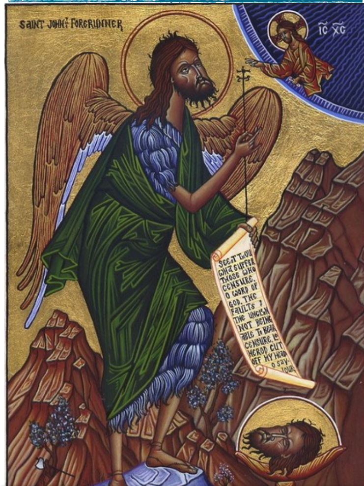
The Beheading of Saint John the Baptist

Join us next door for Coffee, Food, and Fellowship in Christ!