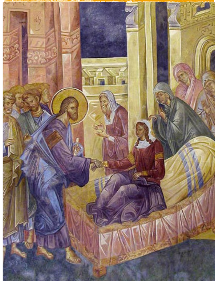
The Raising of the Daughter of Jairus