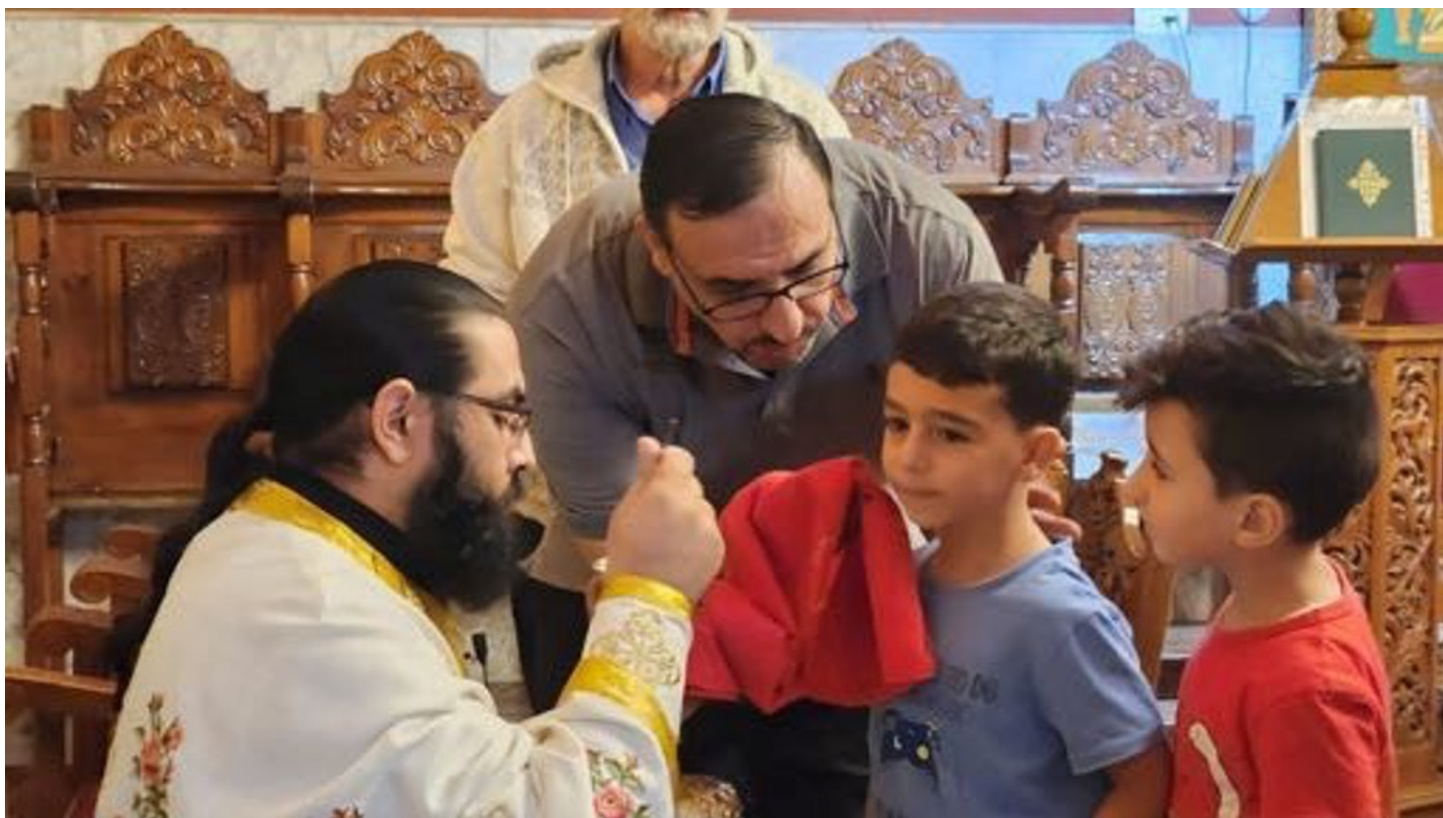
Children Receiving Holy Communion at St. Porphyrius Orthodox Church in Gaza Last Sunday

May God grant rest to the souls of all our departed brothers and sisters in Christ living in war torn regions and may he send his healing peace from above to those suffering and desiring to worship Him in peace and thanksgiving.