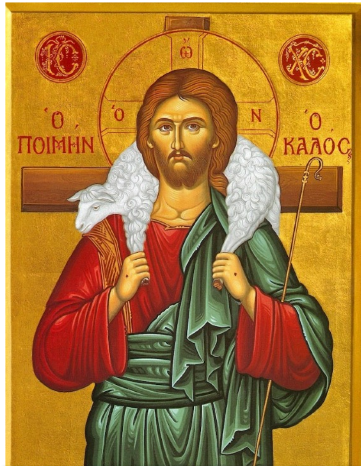
Icon of Christ the Good Shepherd

Join us next door for Coffee, Food, and Fellowship in Christ!