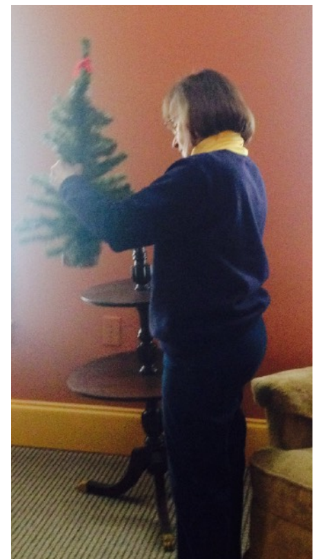
The St. Elizabeth News