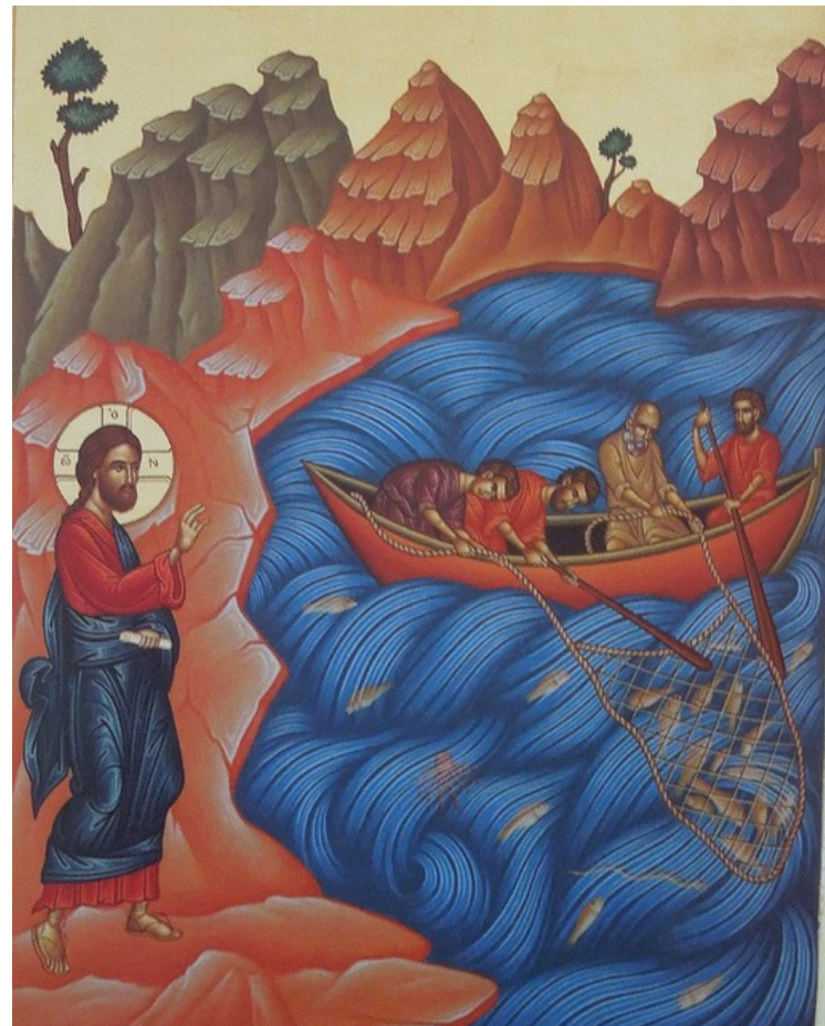
Christ Calls the First Disciples