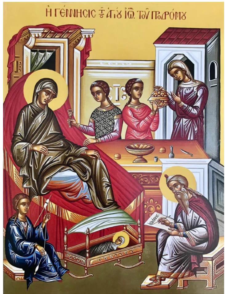
The Nativity of John the Baptist