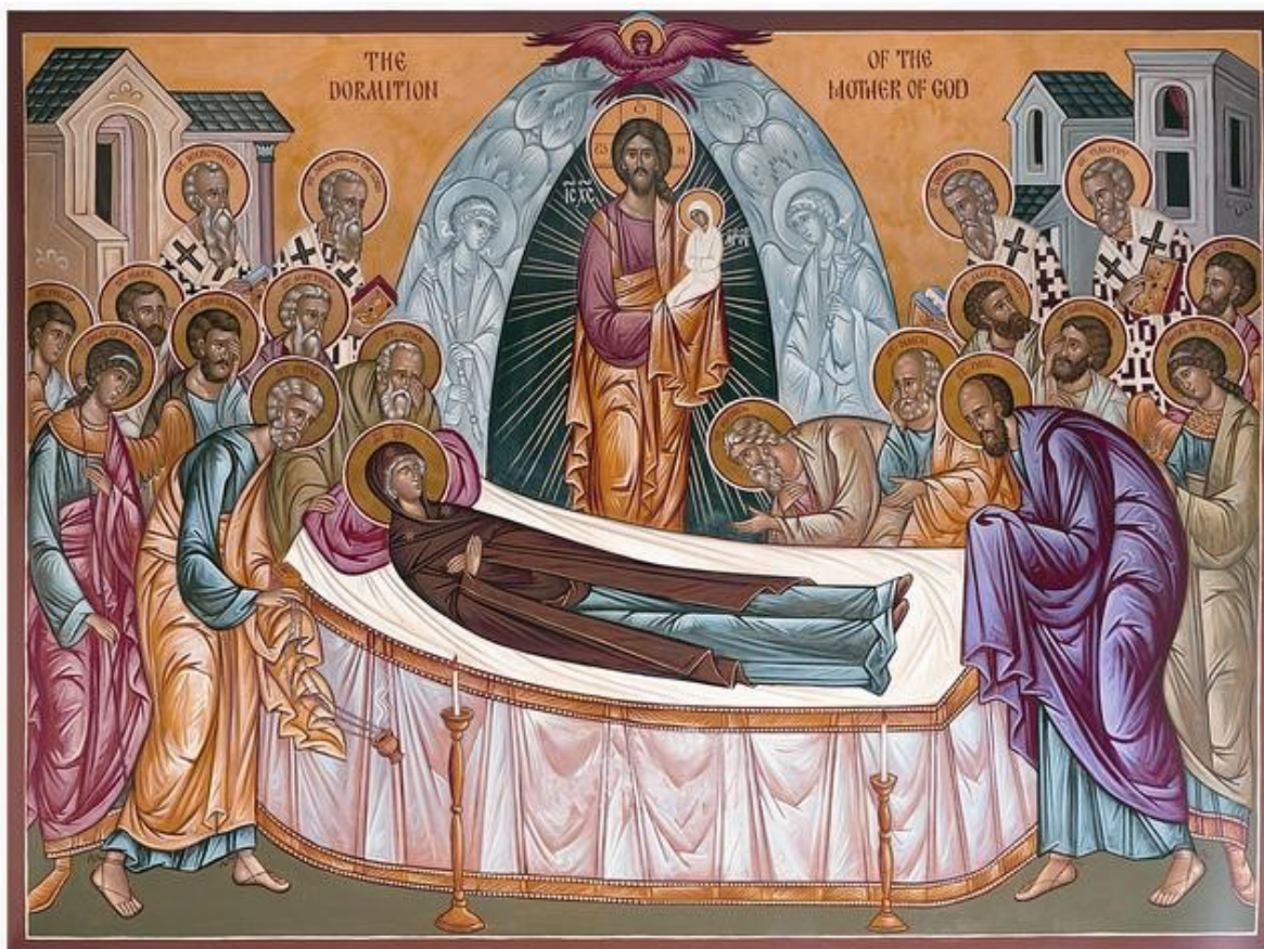
Icon of the Dormition of the Mother of God

The Feast of the Dormition of Our Most Holy Lady, the Theotokos and Ever-Virgin Mary is celebrated on August 15 each year. The Feast commemorates the repose or "falling-asleep" of the Mother of Jesus Christ, our Lord. The Feast also commemorates the translation or assumption into heaven of the body of the Theotokos.